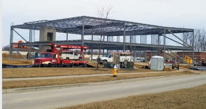
New construction in South Tech Business Park.