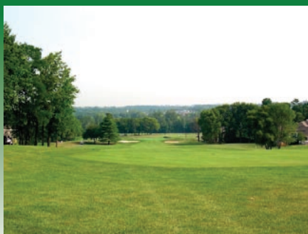
Heatherwoode hole 9