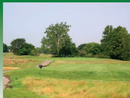
Heatherwoode hole 17