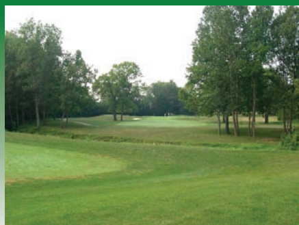
Heatherwoode hole 5