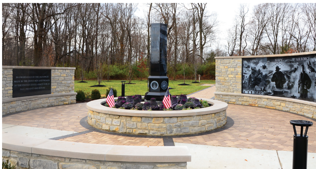
The new Springboro Veterans Memorial.