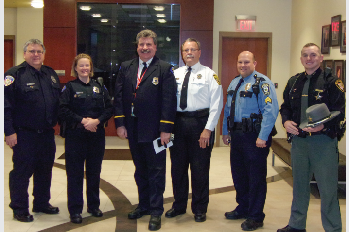
Springboro D.A.R.E. celebrated 25 years in 2017

COMMUNITY SAFETY Under the direction of Chief Jeff Kruithoff, our police department employs 26 officers in command, investigations and patrol, who are dedicated to the safety, security and welfare of our citizens and community. Our 17-hour per day communications center received approximately 16,500 calls for service in 2017 compared to 15,400 in 2016. Our police department also provides a neighborhood crime prevention program and participates in regional law enforcement such as the Warren County Drug Task Force and Miami Valley Tactical Crime Suppression Unit to aid in investigations and policing, and shares costs for specialized services, equipment and training across agencies. Our police officers also work in partnership with the community by meeting with residents to address questions and concerns regarding community safety. This past year, officers responded to traffic concerns in neighborhoods surrounding